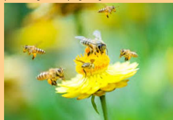
By Ayebazibwe Patrick Hives save Lives

Bee pasture management should also be taken seriously as we address diversity conservation gap of different tree and plant species. All in all I greatly commend TUNADO for good work well done in promoting beekeeping in Uganda