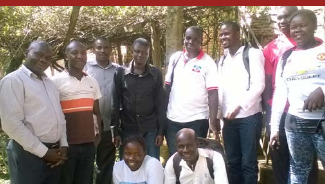
Participants after the training