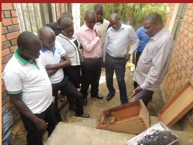
Participants learning how the solar beeswax melting machine works