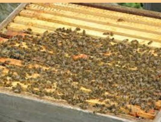
A strong colony like this builds up faster

In an attempt to address skill gap on bee colony management, post-harvest handling, practical training on bee and bee product management should be given to trainers in a kind of refresher course. This will enable trainers to guide beekeepers professionally and this will in turn help producers to manager honey equipment, and apply appropriate principle of honey production, extraction, and processing activities.