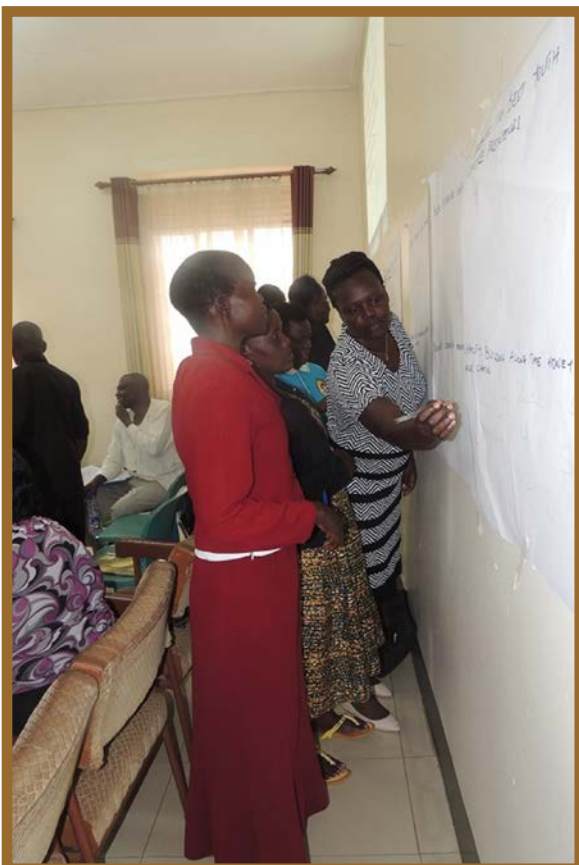
Members voting for priority activities