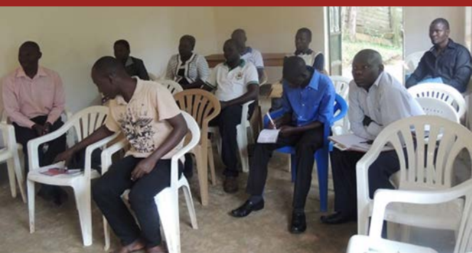
MFI & DFA staff during the training